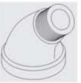
45° Street Elbow