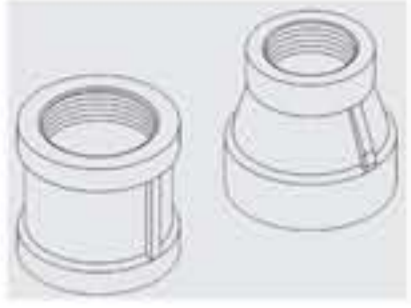
Straight & Reducing Couplings