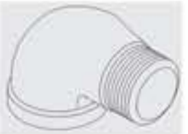
90° Street Elbow