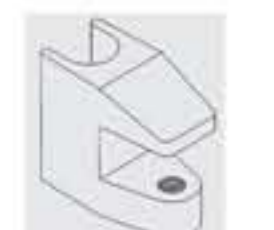
Top Beam Clamp