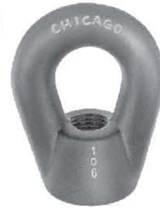
Drilled & Tapped